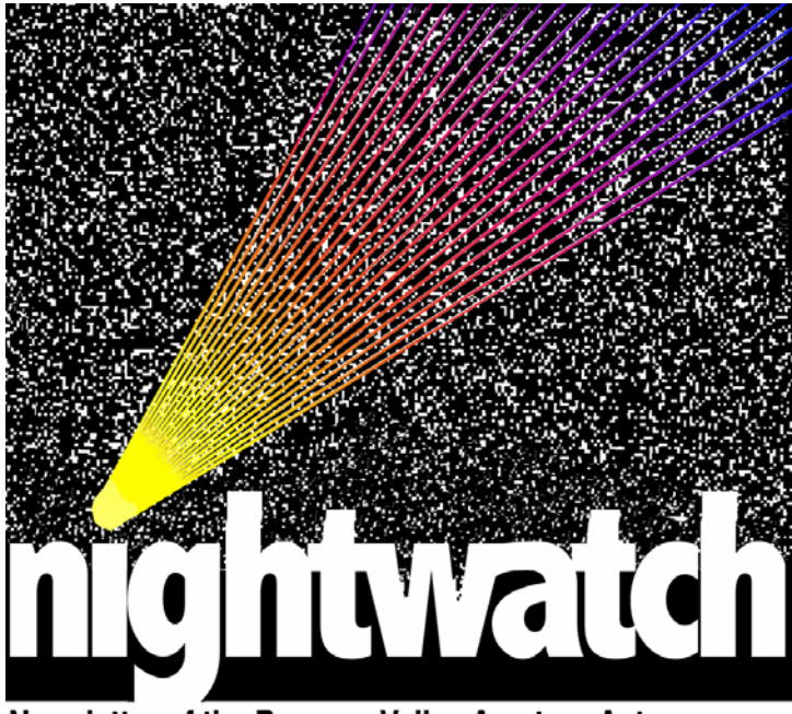
Newsletter of the Pomona Valley Amateur Astronomers

Volume 34 Number 2 nightwatch February 2014