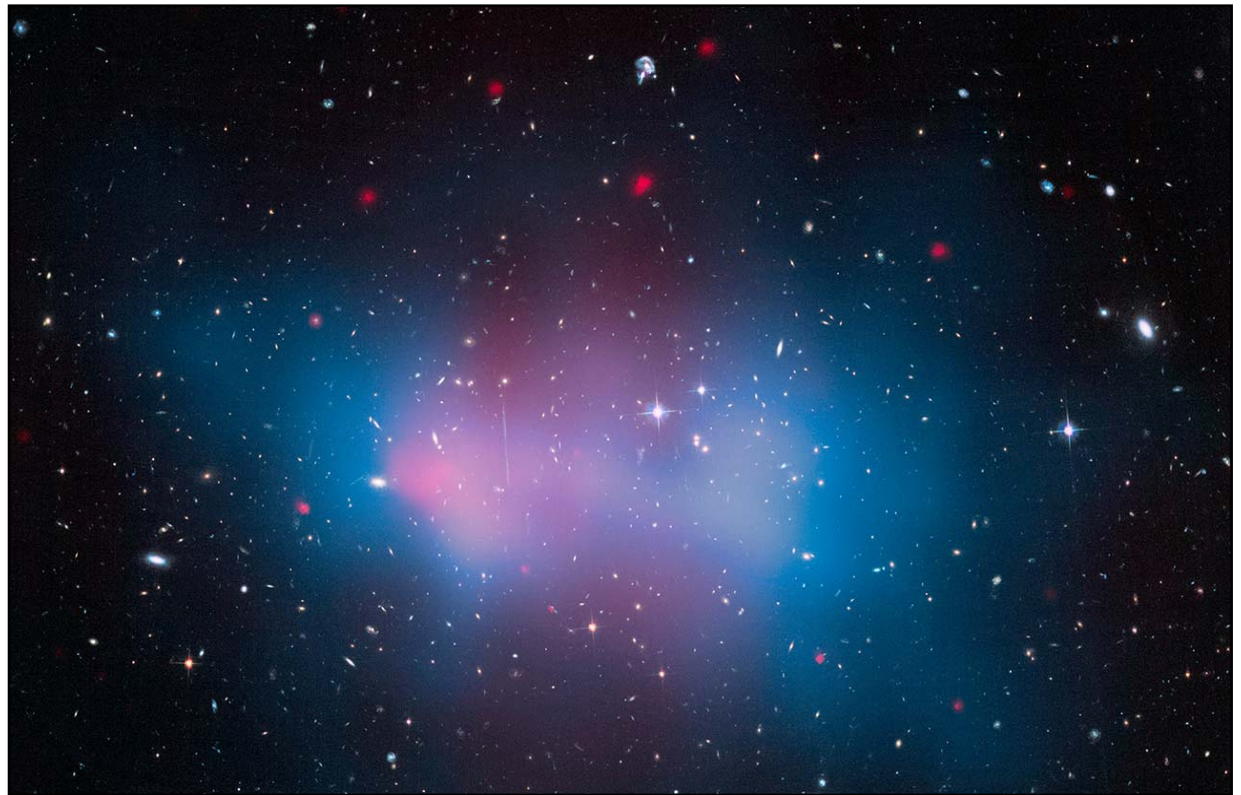
X-rays are shown in pink from Chandra; the overall matter density is shown in blue, from lensing derived from the Hubble space telescope. 10 billion light-years distant

Learn more about "El Gordo" here: http://www.nasa.gov/press/2014/april/nasa-hubble-team-finds-monster-el-gordo-galaxy-cluster-bigger-than-thought/ El Gordo is certainly huge, but what about really tiny galaxies? Kids can learn about satellite galaxies at NASA's Space Place http://spaceplace.nasa.gov/satellite-galaxies/ .