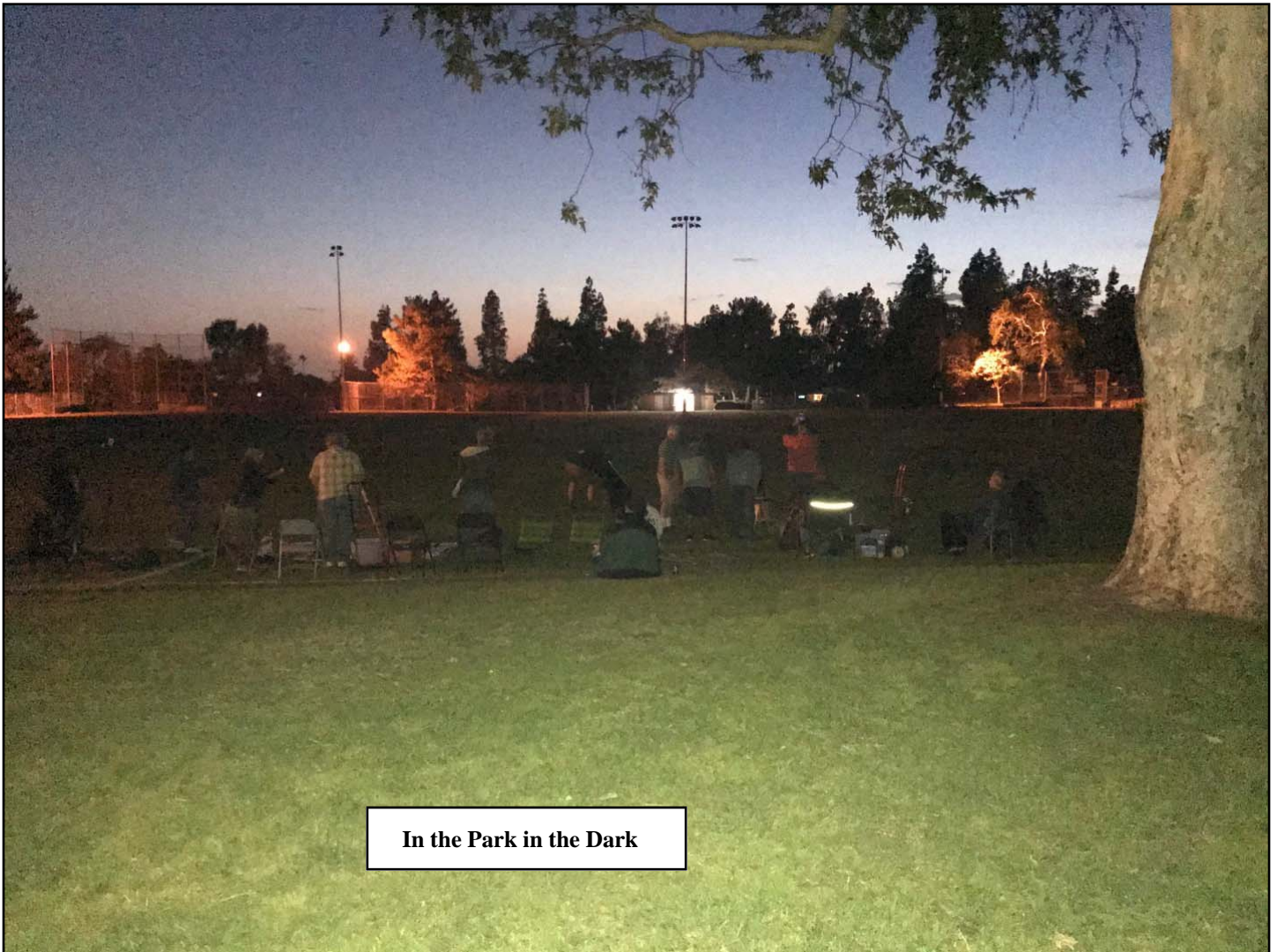
In the Park in the Dark

sextuple system. In the 1600s a colleague of Galileo's realized by looking through a telescope that Mizar was a binary system and in the 1800-1900s it was discovered that each of the binaries was a binary itself – making Mizar a 4-star system. Then in 2009 it was shown that Alcor was also a binary, bringing us to the current total of 6 stars in all.