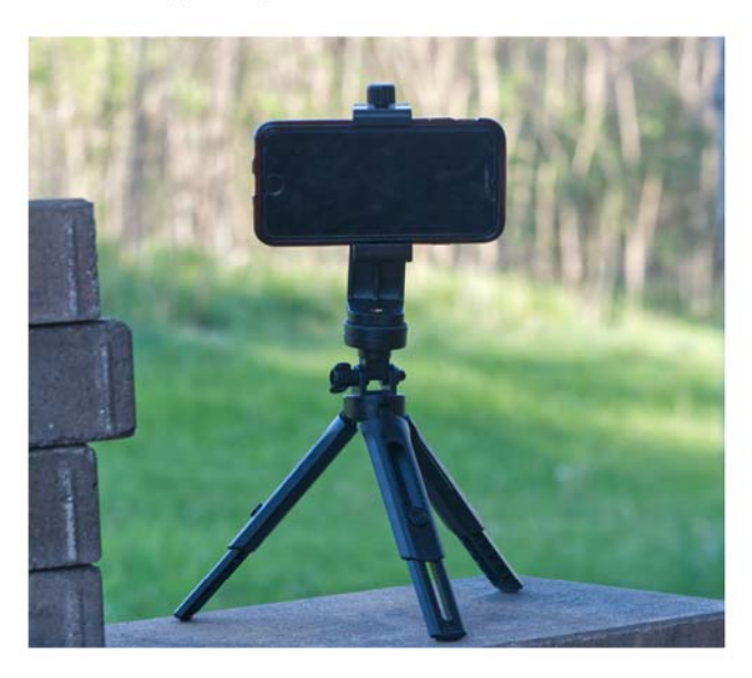
A small tripod for a smartphone. They are relatively inexpensive – the author found this at a local dollar store!