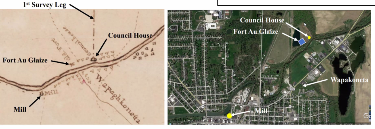
Comparison of 1819 Survey Sketch to Actual Locations of Fort Au Glaize and the Council House

The Wapakoneta Shawnee Reserve was created by the signing of the Treaty of Fort Meigs on September 29, 1817. This was signed by the U.S. and seven Ohio tribes which ceded most their remaining land in Ohio to the U.S. It created the 100 square mile Wapakoneta Reserve. On September 17, 1818 20 square miles was added to the reserve and was witnessed by Neil Armstrong's great-great-great grandfather John Armstrong.