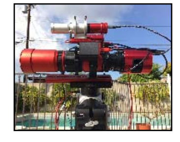
RedCat 51 in parked position.