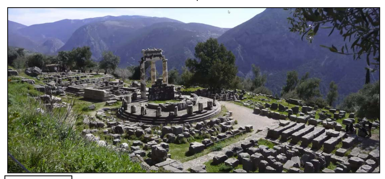
Shrine in Turkey