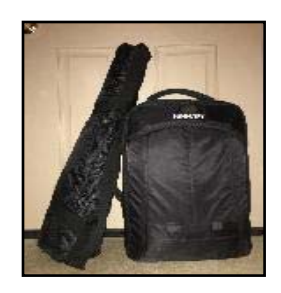
Tripod and telescope ready to travel.

The RedCat 51 is an APO f/4.9 refracting telescope. It has a 51mm aperture with a focal length of 250mm. There is a built-in bahtinov mask in the lens hood. My RedCat is version 2 and has a tilt-adjuster built into the telescope. It also has a built-in 2" filter slot for astronomy filters and a field rotator, so the camera can be rotated to a horizontal position. The RedCat is a Petzval design, that has four elements in three groups that produce a full frame flat field. When I first got the RedCat I was using a Nikon D750 camera. The full frame camera produced a full frame image with considerable vignetting which is eliminated with the calibration frames. I am now using a ZWO ASI2600MC-Pro camera with an APS-C sensor (crop sensor) that does not produce any vignetting. The RedCat is a great grab and go set-up, especially when it is combined with the Rainbow Astro RST-135 mount, a half pier, and a carbon fiber tripod. By Sharol Carter