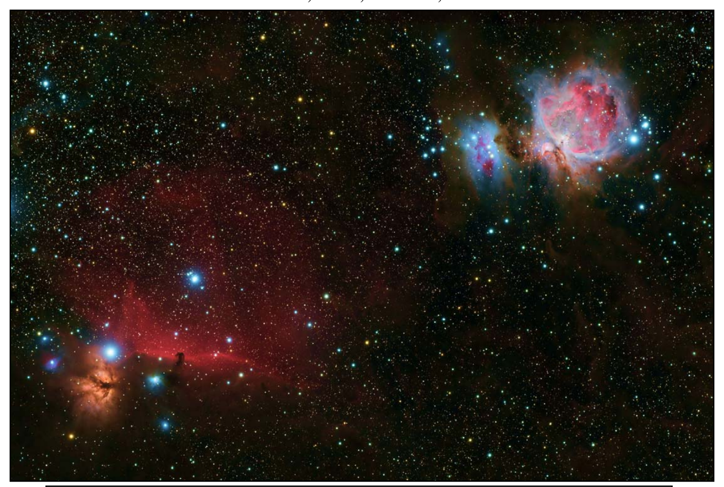
Flame Nebula, Horsehead Nebula, Running Man, and the Great Orion Nebula in the constellation of Orion. Taken the first weekend in December 2021 at GMARS

Equipment used: William Optics RedCat 51, ZWO ASI2600MC-Pro, Rainbow Astro RST-135, ZWO EAF, QHY miniGuideScope, ZWO 120mm Mini, ZWO Filter Drawer, no filter. Captured by ZWO ASIAir Plus and processed in PixInsight.