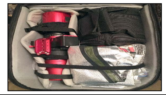
RedCat 51 and Rainbow Astro RST-135 packed in the camera roller bag.