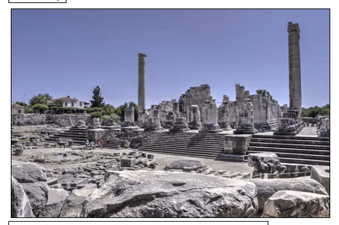
Temple of Apollo - under construction from 330BC to ~600AD and never completed.