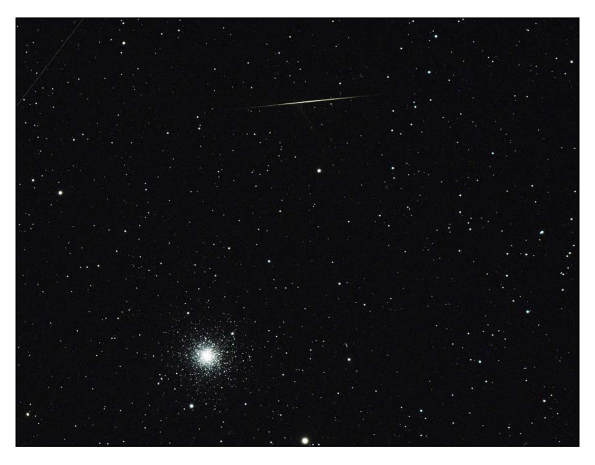
Image description: M3 in the constellation of Canes Venatici with one meteor form the tau Herculids shower. Single 300 second exposure, captured at GMARS on May 30, 2022 with the RedCat 51, ASI2600MC Pro camera with an Optolong L-Pro filter, mounted on a Rainbow Astro RST-135, controlled by ASIAIR Plus and processed in PixInsight and CS5.